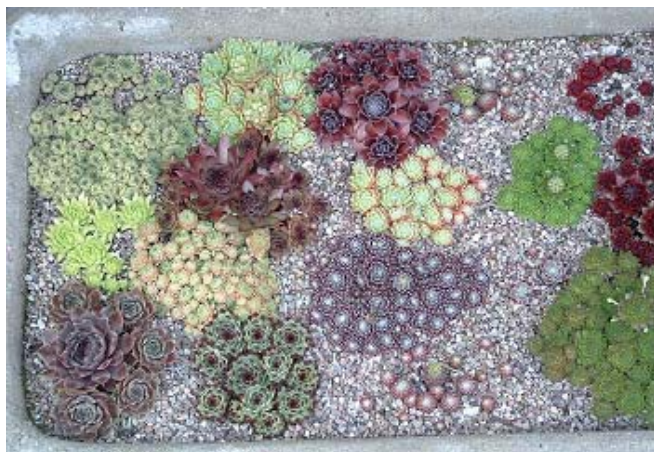
Sempervivums growing in an alpine trough.

Most of the plants seen offered are attractively coloured cultivars. A carefully selected mixture of red, brown and green plants can make a most impressive display in an alpine trough or in a rock garden.