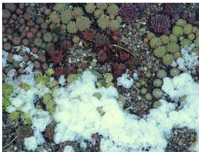
Sempervivums re-appearing as snow melts.

Provided the plants are grown in a well drained, and preferably sunny, location most "Semps" will survive freezing temperatures without difficulty, though it is important that their roots are protected. They should not be left outside in thin plastic pots during the winter months.